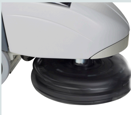
The unique rotating deck and 27 kg brush pressure enable SC351 to clean and dry both forward and backward reaching even the most inaccessible places