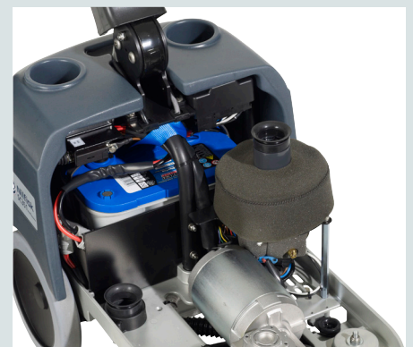
The powerful brush motor is designed for maximum reliability and cleaning performance