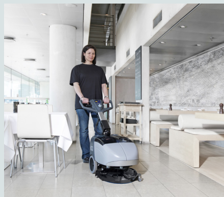
Low sound level allow daytime cleaning in sound sensitive areas