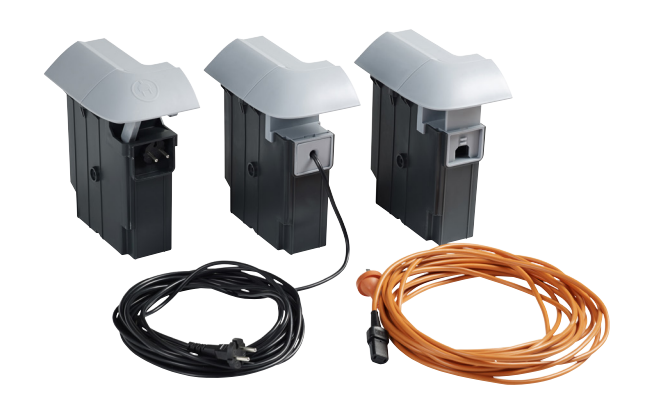
The modular VP600 allows flexibility to choose exactly what cord you need: standard, detachable or cord rewind

The modular design not only allows flexibility to choose exactly what you need but it also makes the machine easy to maintain and service for years to come. When a cord is worn out or damaged, it can easily be replaced by a new cord module in no time, providing you with a machine that need never be out of service.