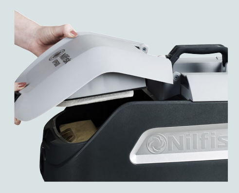
Magnetic hinges securing high reliability