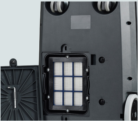
HEPA H13 exhaust filter is standard on all VP600 variants