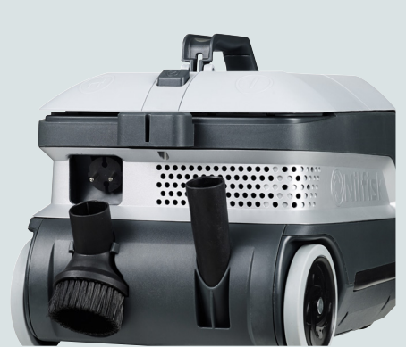
User friendly and easy to reach accessories